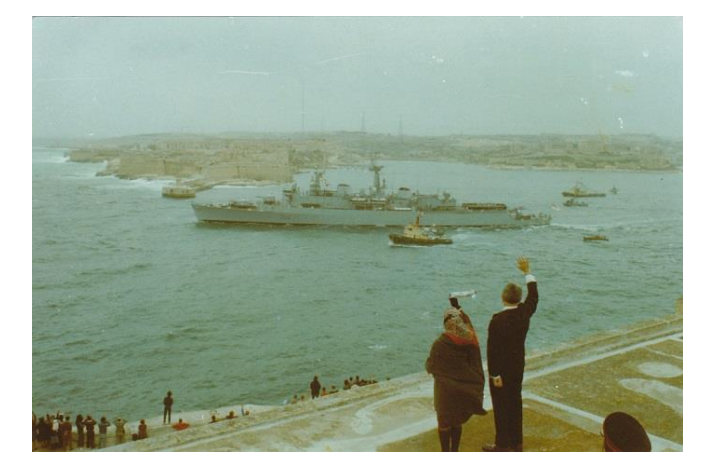
March 31, 1979, the Last of the British Armed Forces Leave Malta after 181 Years.