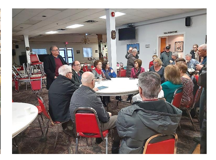
Q & A at the Malta Band Club Sunday, February 16<sup>th</sup>

Maltese-Canadian Museum Archives and Visitors Centre St. Paul the Apostle Church Complex 3224 Dundas St. W., Toronto, ON, M6P 2A3 1-416-767-7054