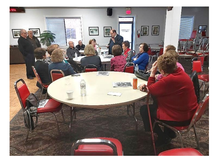
Q & A at the Melita Soccer Club, Saturday, February 15<sup>th</sup>

Two successful Q & A sessions were held with the Consul General of Malta on the weekend of February 15<sup>th</sup>-16<sup>th</sup>. The first took place on Saturday afternoon at the Melita Soccer Club. The second was held, the following afternoon, at the Malta Band Club.