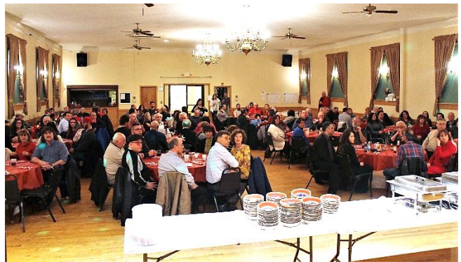
Waiting in Eager Anticipation